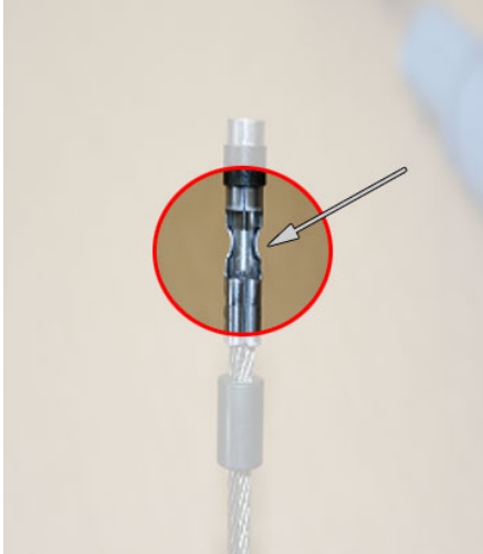
Image on the left shows stock length wire.

Depending on what aftermarket spark plugs you choose to run, you will need to compress the terminals appropriately.